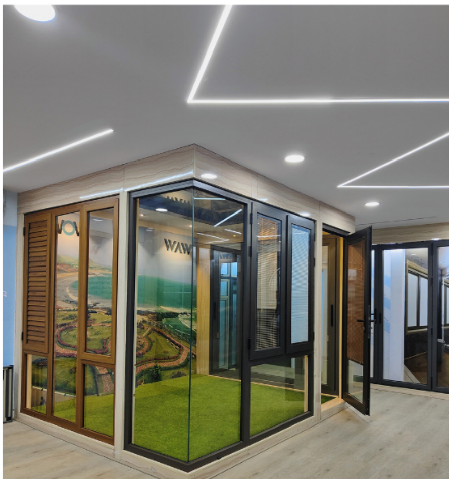
Live experience center

The company has a wide range of products which include:- Sliding, Casement Windows, Folding Doors, Skylight, louvres, Windows with integrated manual & motorized blinds, retractable mesh, office partitions.